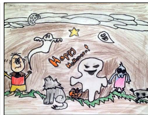
Some of this year's winning entries from Mendham Township Elementary School, Hilltop School and the BRAGG School.